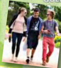
Join the Tam O'Shanter walk.