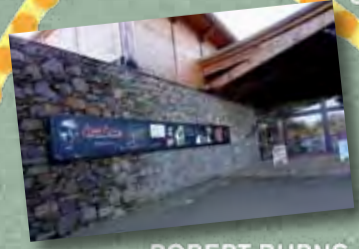
ROBERT BURNS BIRTHPLACE MUSEUM