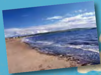
Great views to the Isle of Arran and Ailsa Craig.