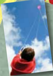
Blackburn car park is a good place to base yourself to explore the area.