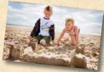
Ayr beach has the benefit of both the natural beach with dunes and maintained sands.