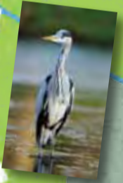
Spot the otter and heron at River Doon.