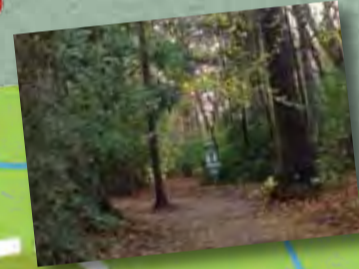
Segregated bridle paths.