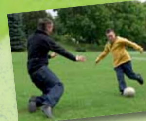
Come and try the trim tracks or the football pitches here.